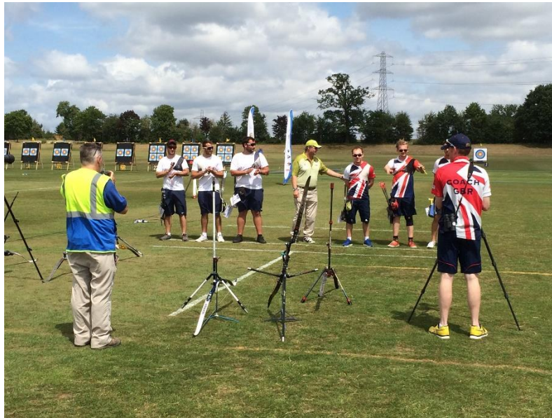
GB v France in 2015

The County of Surrey would like to welcome you to Stage 3 and Stage 4 of the 2016 UK National Series World Record Status Head to Head and 50m/70m rounds